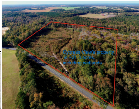
Check out this bird's eye view of our property (above) and our proposed site plan (left.)